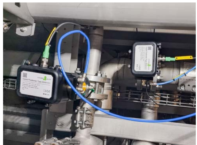
In interaction with the other components in the tunnel pasteuriser, sliding gate valves with IO-link from Schubert & Salzer ensure longer shelf lives of the quality products from RHODIUS.