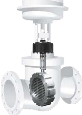
Size comparison between a normal seat valve and a Schubert & Salzer sliding gate valve. In the example, the nominal size of both valves is identical.