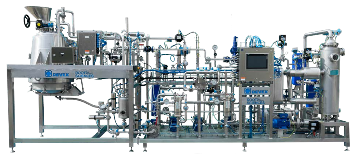
With the CryoEXS plant, it is possible to extract cannabis oil from hemp, filter it, connect an ethanol recovery system and and as a final step, carry out a decarboxylation, that transforms the acid in the oil in order to refine it, and that in a closed complete system. Due to their high degree of control precision, sliding gate valves can hereby be used in cryo ex applications as they provide for a very gentle and productive extraction of cannabidiol.

sembled units, this being accompanied by our engineers. The compactness of the sliding gate valves is an advantage during the installation but not only that: these control valves can be easily maintained by the plant operator after completion of the commissioning, it also being possible to adapt them to the changing process parameters. As we normally fit our plants with sliding gate valves with a size of DN50, the benefit gained by the compactness and the low weight is not quite so striking, but I do not want to miss them, nevertheless. Especially as this makes it much easier for our customers to maintain and service their plants."